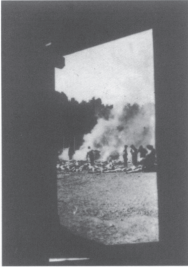
[Fig. 1: #280, Auschwitz-Birkenau State Museum]