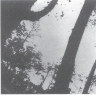
[Fig.3: #282]