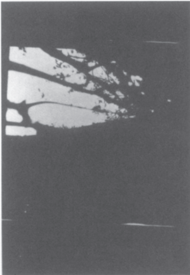
[Fig.4: #283, Auschwitz-Birkenau State Museum]

But suppose we did come to the photographs cold. What could be said about them? Firstly, their startling nature emphasises a paradox common to all photographs: the contradiction between the static signifier (the unchanging photograph which one can hold in one's hand) and the active signified. Here this paradox is emphasised because the signified, the moment in the infinite sequence of time which has